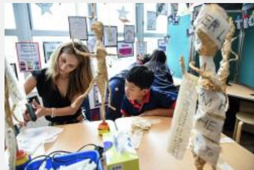
PYP Exhibition at Quarry Bay School

ESF is extremely proud of the achievement of our Year 6 students who have taken action around important local and global issues. All students have confidently and creatively shared their learning with the wider ESF community through their advocacy campaigns and the exhibition.