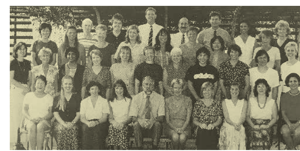
SJS staff in 1997