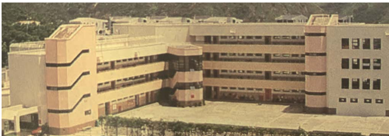
SJS in 1997