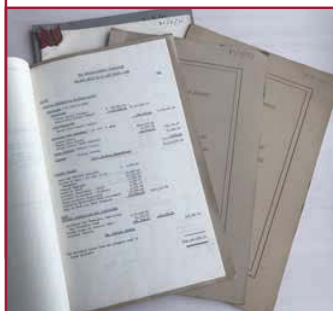
ESF's first set of accounts in 1968

1975 — Bradbury School opened as Causeway Bay School on Eastern Hospital Road. The school moved to its present site at Stubbs Road in 1980.