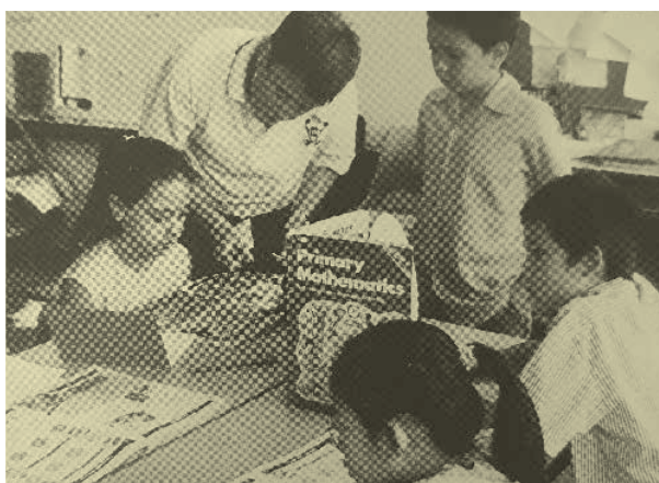
Maths lesson 30 years ago