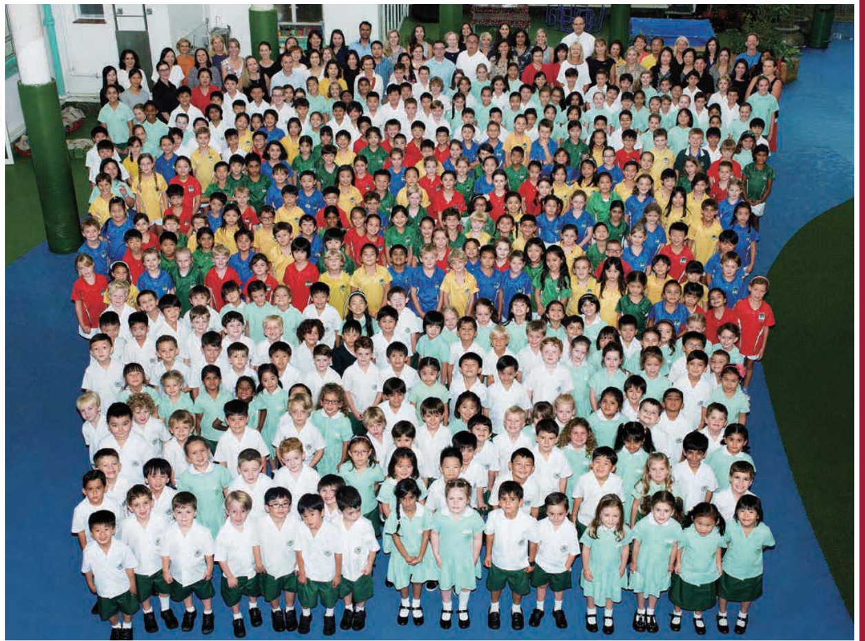
Peak School 2017