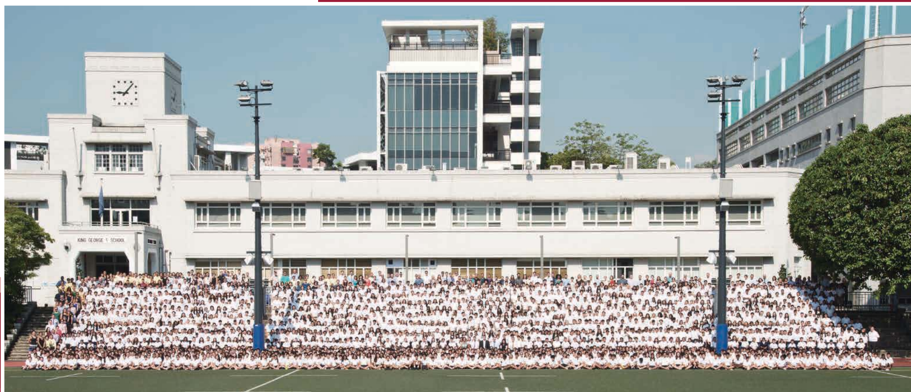
King George V School 2017